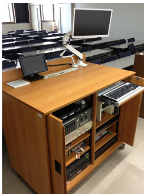
Figure 1. The TDS

Kagawa University developed the Kagawa University type IT desk system (TDS) to support the effective enforcement of the class using ICT devices installed in the classroom in Kagawa University[1]. TDS can operate the ICT devices which were installed in the classroom by using the ICT device control system on the same interface. Figure 1 shows the TDS. Various kinds of ICT devices are stored in the TDS. Figure 2 shows the interface of the ICT device control system. The system is operated by iPad. All the ICT device operations are conducted through ICT device control system from iPad, and all operation logs are stored in the ICT device control system. Table 1 shows ICT devices installed in the TDS. TDS has been used in ten classrooms of Kagawa University. ICT devices play an important role in institutes, and therefore the effect of the introduced systems needs to be evaluated to keep or improve the performance of the institutes within the limited budgets and time. For example, many educational institutes including universities have introduced ICT devices to support effective on-site/remote teaching using multimedia contents, and some of them were evaluated by using limited methods such as questionnaire survey. TDSs which consist of various kinds of ICT devices have been developed and installed in classrooms,