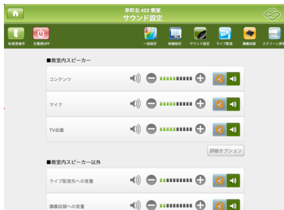
Figure 2. Screen Image of the Interface of TDS