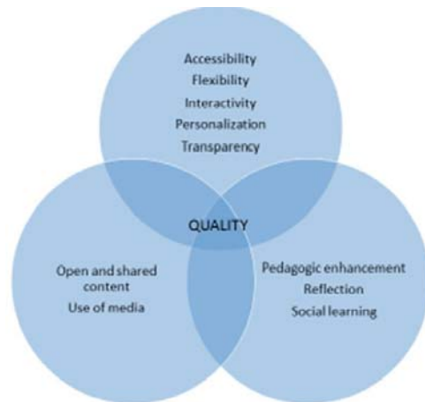
Figure 1. Quality indicators for OERs and MOOCs.

There are quality standards and rubrics have focused significantly on the quality of OERs and MOOCs. Camilleri, Ehlers, Pawlowski figured out that "quality assurance requires pedagogical enhancement, pedagogical stakeholders, and pedagogical resources" [4]. Furthermore, open standards for quality assurance of OER and MOOC would assist in measuring quality in more globally accepted terms [11].