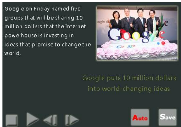
Figure 2. The English learning of the ODES system.