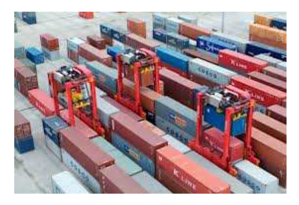
Fig. 1 Straddle carriers circulating in a containers yard

time required to unload ships. The importance of this factor is justified by the fact that it is more beneficial for both the port and the customers to shorten the stay of vessels. First, it is better for the port to quickly free the berths in order to allocate them to others incoming vessels. Second, generally, ship-owners rent vessels; therefore, they tend to minimize the berthing durations in order to reduce rental costs. These two issues are addressed in this paper. We consider a modern container terminal, which uses SC instead of Internal Trucks (IT). The advantage of a SC is that it is able to lift and to store a container itself; therefore it is not necessary to use Yard Cranes (YC). A storage yard is composed of several blocks. In order to allow good circulation of SC, each block is composed of bays which are separated by small spaces. In every bay, there are stacks wherein containers are stored. A stack must have a height inferior or equal to the limit fixed by the port authorities. Fig. 1 shows an example of block wherein circulate straddle carriers.