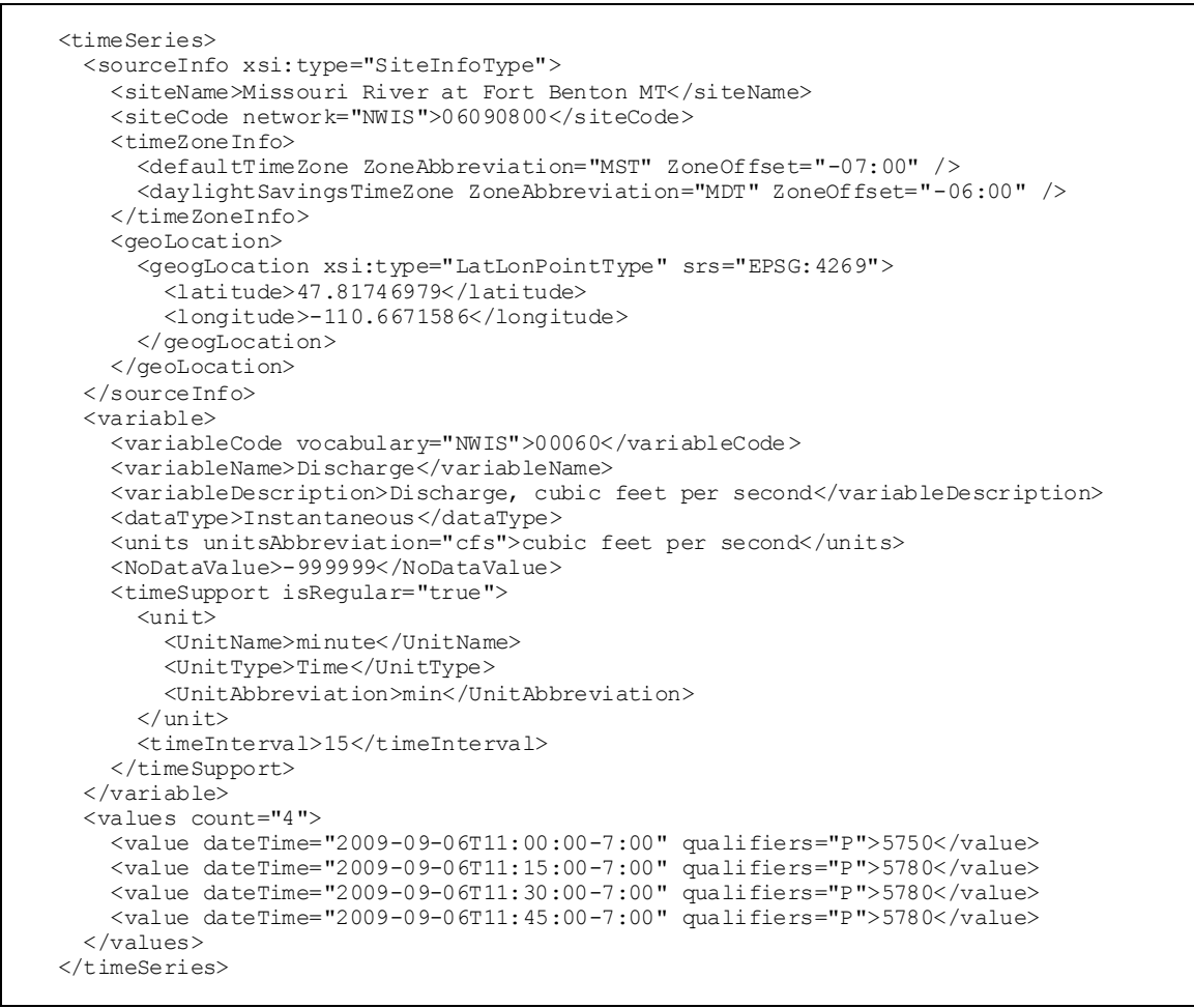
Figure 2. Excerpt from WaterOneFlow GetValues response