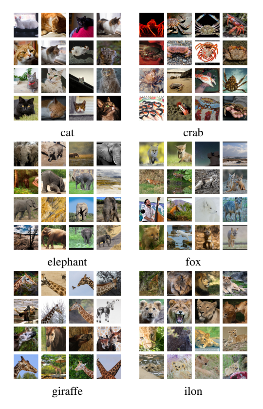
Figure 2. Example of Constructed Image Data Set

Table I suggests that "cat", "crab", and "lion" gave more than 90 % accuracy. "crab" included some cuisine images but noise images were removed correctly. "fox" corrected some inappropriate images including building or humans. "giraffe" was judged as zebra or kangaroo and this decreased accuracy. Copyright (c) IARIA, 2018. ISBN: 978-1-61208-612-5