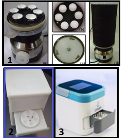
Figure 2. Prototypes and plate tests. (1): with recycled material [9]. (2) with electronics included [10]. (3) with a screen and small dimensions.

The development of the different prototypes and plates test (where the reagents were placed with the blood) allowed to improve their capabilities, including speed of test, visualization of the reactions, efficacy of detection and the diminution of its dimensions facilitating the portability of the future product [9] [10], Figure 2.