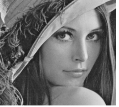
Figure 1. Lina Cover Image

However, the genetic algorithm is used to minimize the error due to hiding the foreign message carrier into cover images. The method is based on statistical analysis of images and their values are varying according to the applied key (seed) number. This is done by studying the neighboring pixels surrounding the chosen bit and changing its value to match the adjacent one in a way that prevent any statistical tracing. The Lina cover image in Figure 1 provides special features and will be used in this research work as a test image.