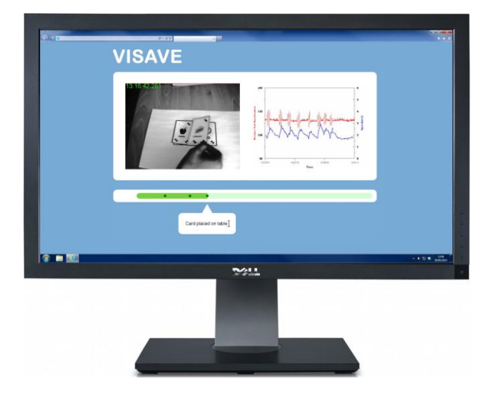
Figure 3 – The conceptual VISAVE interface displayed on a desktop computer.