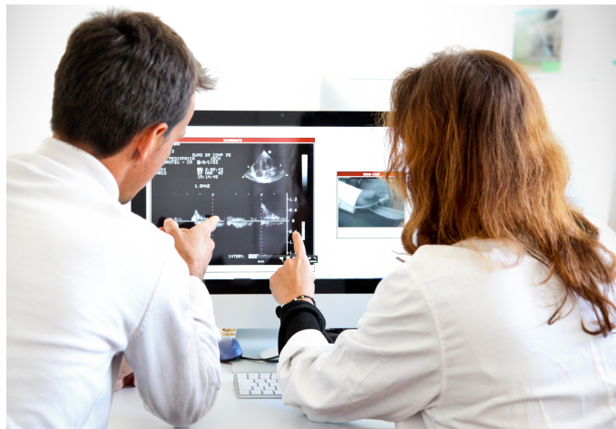
Figure 1. Representation of the two video streams (ultrasound and ambient camera)

tested in the region of Sardinia where there is a mean incidence of CHDs of 20.25‰ (more than twice the incidence in literature) [19] and where the 17.3% (284,000 people) of population is concentrated in two big cities (>100,000 inhabitants) and the remaining 82.7% (1.4 Million people) is dispersed across a great number of small villages (375) in a relatively large territory (24,090 km 2 ) [20]. The main objectives of the project are to: