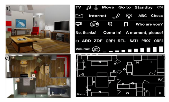
Fig. 2 Two views of the virtual smart home and the corresponding control masks.

A virtual 3D representation of a smart home was designed based on the XVR environment (eXtreme Virtual Reality, University of Pisa) [10] [11]. Seven different control masks were developed for the P300 BCI in order to control the virtual smart home environment.