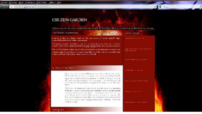
Figure 2. The two UIs used in data collection.

All the CSS Zen Garden web pages were looked through and opened in new tabs. The web pages were first divided into two categories and then compared step by step, finally resulting in two example web pages.