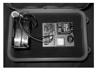
Fig. 2: The sensing unit prototype

The sensing unit prototype is pictured in Figure 2. It is based on the PIC16F87-I/P micro controller acting as a control unit. This Peripheral Interface Controllers (PIC) provides an internal clock up to 8MHz, and supports both UART digital communication and I^2C peripherals. Two different sensor modules are connected to the control unit: a) a Global Position System (GPS) UART sensor that includes the PIC receiver serial line; b) a 3D accelerometer and magnetometer LSM303DLHC sensor based on the I^2C protocol, linked to the specific PIC input line. The magnetometer provides raw data that can be used to calculate the sensing unit position as well as the pitch, roll and heading. The PIC serial line output is instead connected to a wireless module supporting the ZigBee protocol. To provide a high rate of samples, all sensor modules are set to a refresh rate of 5Hz. The control unit executes a