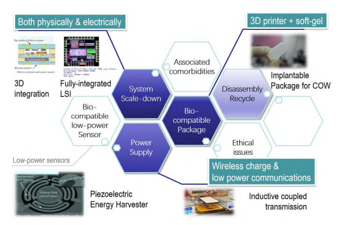
Figure 1. Challenges and some of our related works to scale-down wireless sensor nodes applicable to biotelemetry.

Decades before Internet of Things (IoT) and Wireless Sensor Network (WSN) came to our field of knowledge, biotelemetry systems have been developed for remote monitoring and gathering of various vital signs from animals and ambulatory patients [1]. However, the explosive growth in practical applications has happened in recent years because of the advances in wireless sensing technology, artificial intelligence, smart portable electronics devices, as well as medical diagnostic techniques. The so-called new era of biotelemetry aims at not only sick people, but also keeping people healthy, especially in the population aging societies [2]. Therefore, it requires more accurate and reliable data in real time, as well as acceptable production cost. In addition, a bio-compatible package and a userfriendly interface are essential requirements as well for ubiquitous applications.