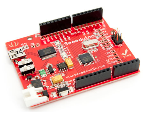
Figure 2. Seeeduino board

1) Sensor Node (SN): A SN periodically measures the distance with the sensor and compares it with the last measurement. If the result has changed it sends an advertisement message (ADV) to the cluster head.