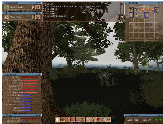
Figure 2. Original MMOG screenshot.