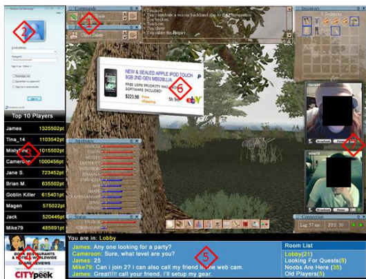
Figure 3. IGIT-modified MMOG screenshot.