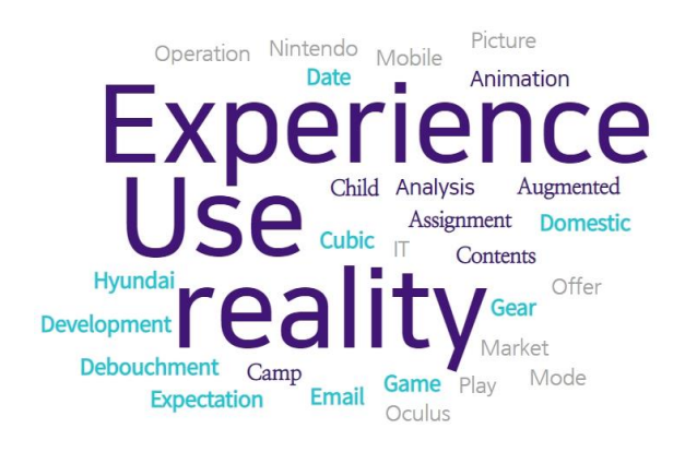
Figure 2. Visualize VR as a keyword in Word Cloud