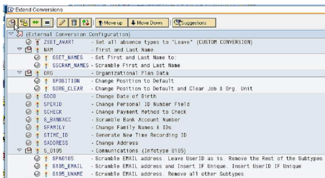
Figure 1. Conversions for HR data.

Such variety of types of application data makes us searching for vendors which provide support on data copy and data anonymization for the most of SAP system types. Especially it concerns the availability of pre-defined data transformation (conversion) rules in a solution. The examples of such conversions for HR data implemented in Data Sync Manager for HCM tool are shown in Fig. 1.