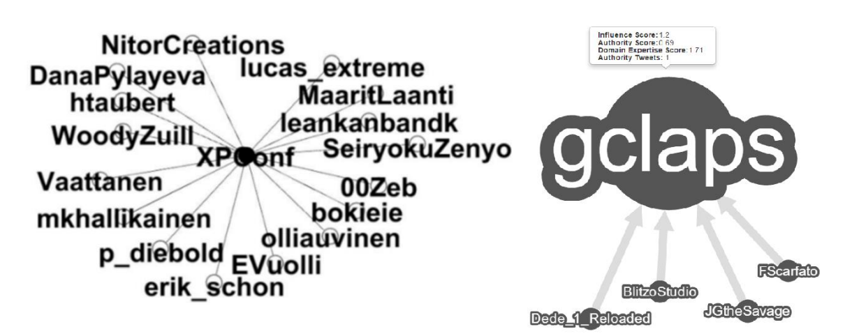
Figure 5. (a) Most popular users for the '#XP2015' term. (b) The most influential user for the second use case for the 'agile development' term.