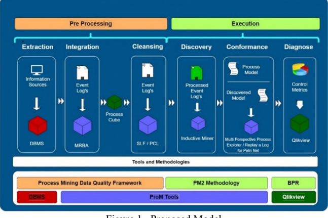
Figure 1. Proposed Model

For the structural analysis of the event log, the model contemplates metrics proposed in Kherbouche work, of which the following are used to calculate the level of complexity and variability of the process based on the information contained in the Event log [11]. The metrics are Average Trace Size (ATS), Average Trace Lenght (ATL), Average Loops per Trace (ALT), Density (DN) and Trace Heterogeneity Rate (THR).