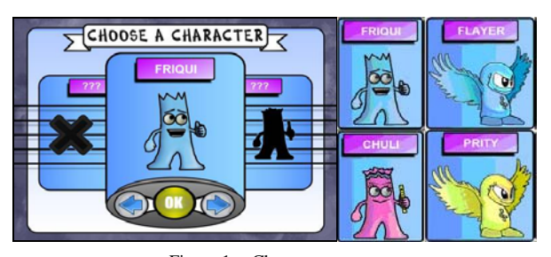
Figure 1. Character screen.

Games have been included in PLAIME because they can be effective teaching and learning tools and the incorporation of multimedia stimuli and games is a motivational factor for children, enticing them to use the software [16]. Moreover, by using these games, pupils (handicapped or not) play with