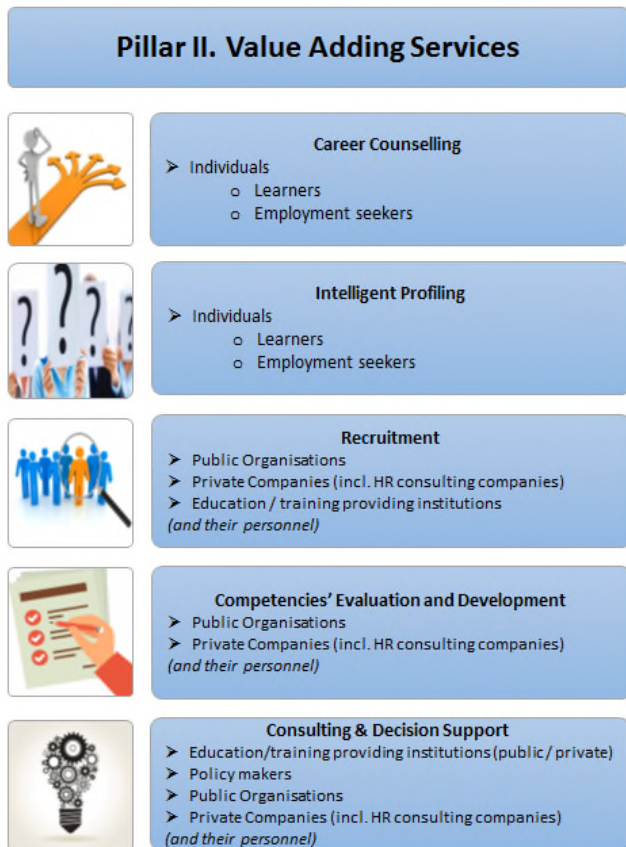
Figure 3. QualiChain Value Adding Services

The second pillar (see Figure 3) will build upon QualiChain baseline services to offer with the help of the computational intelligence, embodied in data analytics and decision support algorithms, as well as gamification techniques, a set of more advanced services, including career counselling, intelligent profiling, and competency management and within the context of the latter recruitment and evaluation support, and consulting.