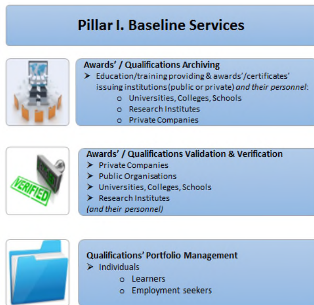
Figure 2. QualiChain Baseline Services

In fact, QualiChain services will be structured along two main pillars.