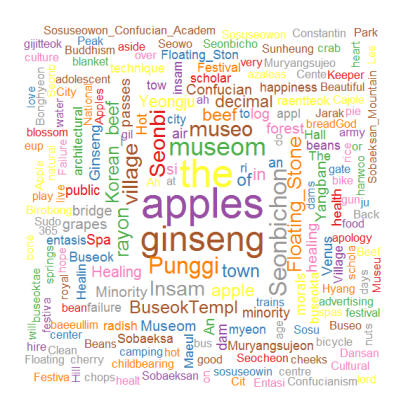
Figure 1. Word cloud based on frequency of promotional keywords

Figure 1 shows it processed by word cloud according to frequency.