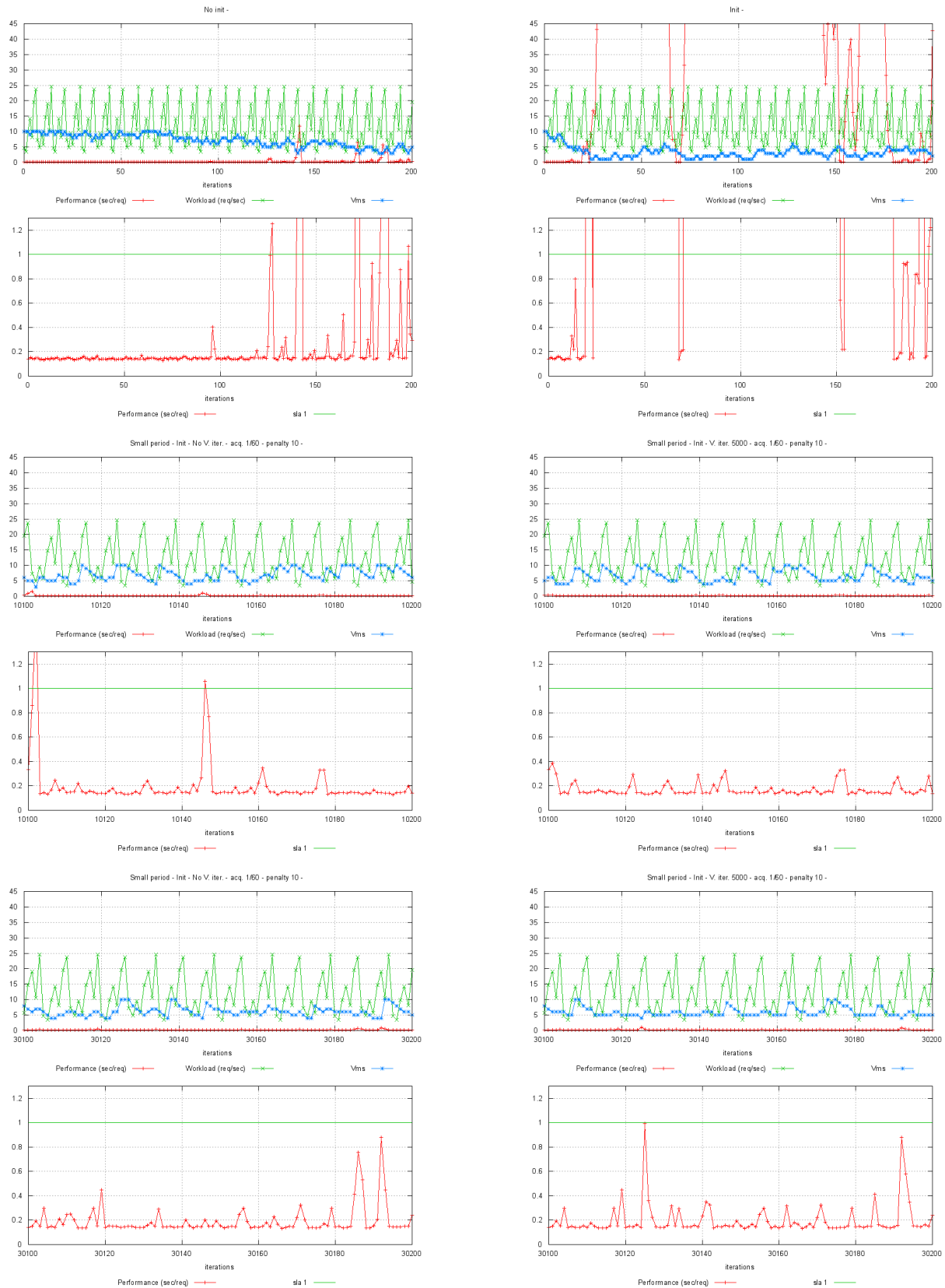
Fig. 3. Comparison between the decisions made during the learning process as observations pass given that convergence speedups are applied or not. On the left, plots show decisions and the resulting performance when no speedup is made, while on the right convergence speedups are applied every 5,000 observations.