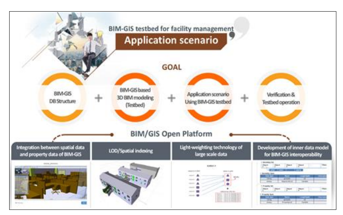
Figure 1. Research overview

verification & test-bed operation. These technologies are implemented on 'BIM on GIS platform', in Section 3.