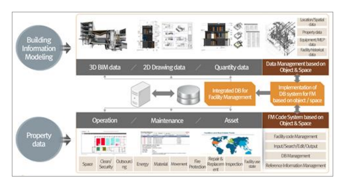
Figure 3. BIM/GIS Property data modeling process based on 3D architectural drawing

Beginning construction of satellite/aerial image, which was based on the platform, we worked the confirmation of site boundary/name, POI, standard classification system, basic property data, site survey, and actual images. Then based on these, we modeled BIM main data and building shape data with texturing according to Level of Detail (LOD). After that, main MEP and structure BIM modeling was worked, and all data was exchanged to Industry Foundation Classes (IFC), which BIM standard format for data verification. Finally through data converting, last data was loaded on BIM on GIS platform with inner format for interoperability.