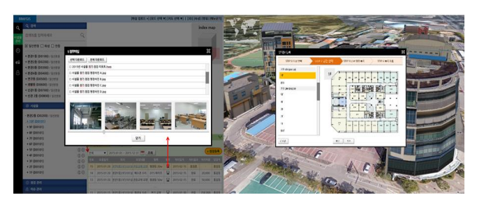
Figure 5. User Interface of BIM on GIS platform for FM

The scenario for facility management is as follows. To design it, we checked current KICT situation and FM process targeting KICT headquarter with FM manager. DB was constructed according to each work based on field survey, and FM data would be managed by space/floor/building unit (Fig. 5).