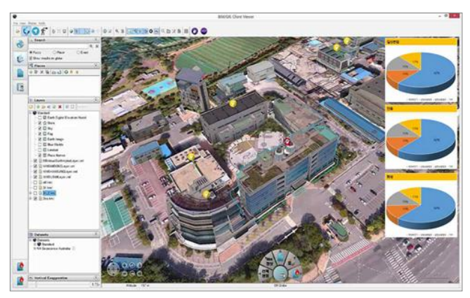
Figure 8. Searching for energy consumption of buildings

This scenario is for visualizing the energy consumption of each building in test-bed through sensors, which are situated at buildings before. When user converts a default mode into an energy consumption mode, basically the number of consumption is shown by sites with table or graph (Fig. 8). As selecting the site where the user wants to manage, the results are monitored in real time with space/floor/building/site for usage.