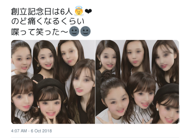
Figure 1. A school foundation day tweet submitted by a high school student, momone , on 6th October 2018.

students' privacy. (exp 1) is the text of her tweet.