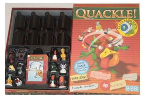
Figure 1. Photo of the game Quackle! with animals, cards, and barns on the

The game, which was awarded "Game of the Year" in Denmark in 2006, is a typical funny board game for humans aged 5 and above. In short, the game consists of 12 different animal figures, 8 barns, and 97 playing cards with pictures of the animals and one arrow card (see Figure 1). The game starts with each player pulling an animal figure from a cloth bag showing it to the others and then hiding it in his barn so the others can no longer see it. The cards are dealt and placed in a pile in front of each player face down.