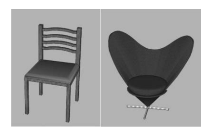
Figure 2. Classical chair (left), Abstract chair (right)