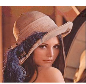
Stego image (1 bit per channel) Stego image (5 bits per channel)