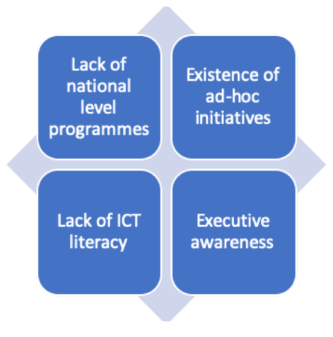
Figure 2. Themes from Inductive and Deductive Analysis

More specifically, the four main themes that emerged from the deductive approach are: a) the lack of national level programmes; b) the existence of ad-hoc initiatives; c) the relationship between ICT literacy (the ability to use digital technology and tools) and awareness and d) executive awareness. In a similar vein, the inductive approach identified four themes which revolved around the same concepts described in the deductive analysis; the difference being that excerpts in the inductive themes pertained information about recommendations and next steps.