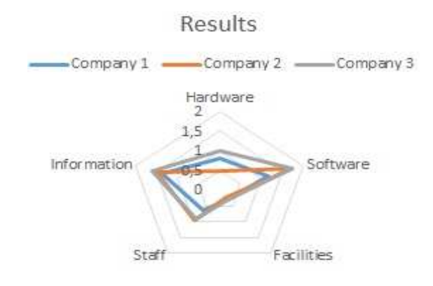
Figure 2. Results.

According to figure 2, Company 1 and 2 are at Level 1 maturity in information security. Meanwhile, Company 3 is at Level 2. Results show that the software area has more investment than others and facilities area has the lowest investment. A monitored environment may be able to inhibit harmful actions caused by employees or people who do not work in the organization. However, if the company does not provide training in accordance with the rules and punishments applied to employees, they face the risk of information security threats caused by internal factors.