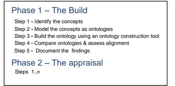
Figure 2. Research setting, overview and scope.

Regulation includes any laws or other rules that govern the conduct of people or businesses (service consumers) and affect them either directly or indirectly, sometimes in ways that are more apparent than others [11]. For example, it is apparent that the payment of FTB is covered by Division 1 'Family tax benefit', of Part 3 'Payment of family assistance', in the 'A New Tax System (Family Assistance)