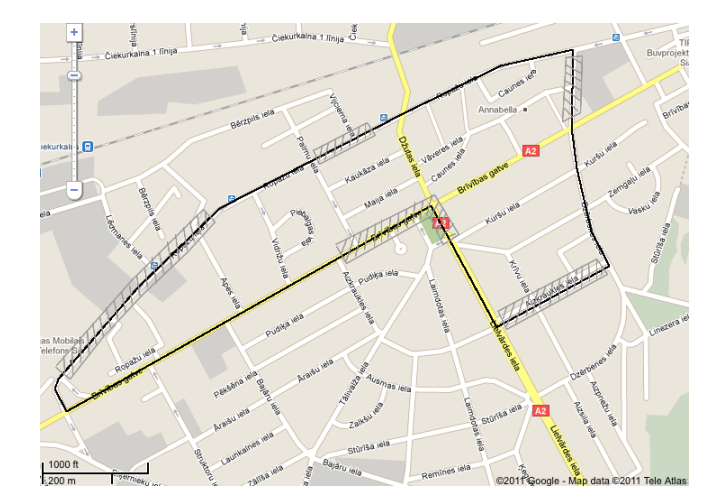
Figure 2. Used experimental test track, 4.4km long, single and multi lane streets in urban environment. Regions marked have most of the potholes.

The experimental setup and collected data characteristics is shown in Table I. Overall, the track is 4.4km long (2.73 miles). Five different Android smartphones were used: Samsung i5700, HTC Desire, Samsung Galaxy S, HTC Desire Z, and HTC HD2. Five different test drives were performed (25th and 28th of January, 10th and 28th of February, and 24th of March, 2011), using three different vehicles: BMW 323 Touring, Mitsubishi Space Wagon, and