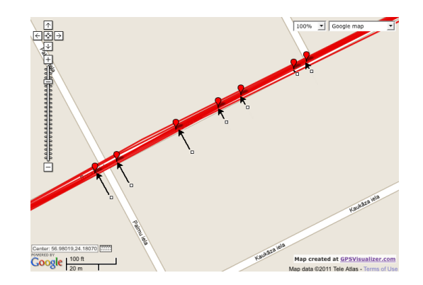
Figure 3. Manually marked ground-truth position improvement, by calculating perpendiculars to the test drive trajectory

There is no classification possibilities. All the potholes are considered equal, regardless of their actual size and significance. Multiple pothole type support in groundtruth marking software would be practically useless, as