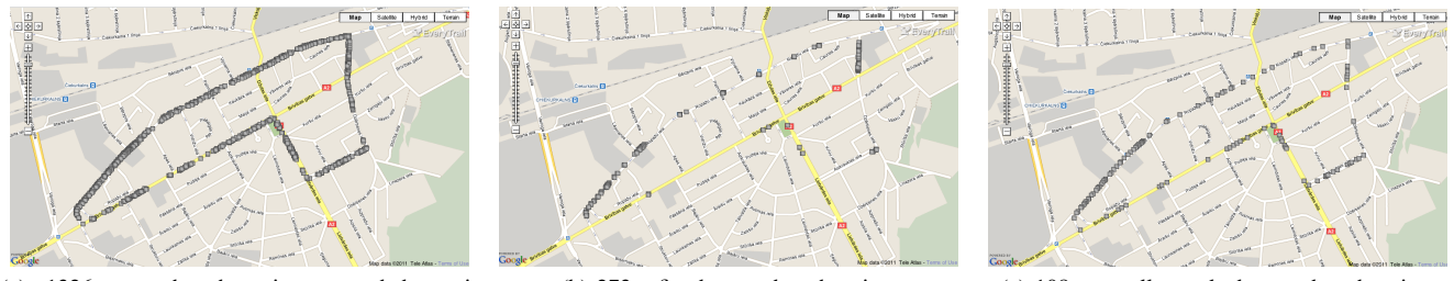
(a) 1326 ground-truth points recorded semiautomatically during the 131 minute long 4th drive