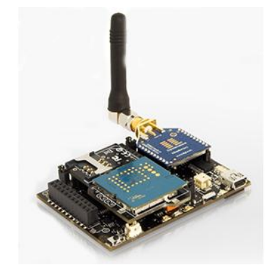
Figure 2. Libelium Waspmote [5].

The results from the energy consumption measurements was used as input to a Java simulator built for the purpose of evaluating the three different algorithms in a realistic sheep grazing scenario with between 50 and 250 sheep. The simulator placed the sheep randomly in a landscape measuring 5000 x 5000 meters. Every sheep was equipped with a transceiver that had a range which followed a gaussian distribution with a configurable average.