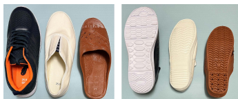
Figure 2. Shoes used for data collection.