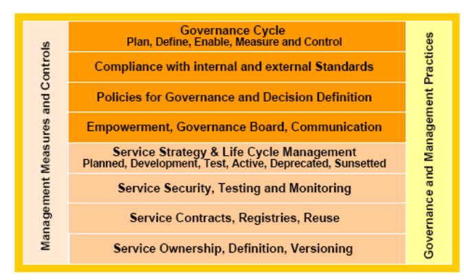
Figure 1. ESARC - Architecture Governance and Management.

The ESARC – Enterprise Services Architecture Reference Cube unifies orthogonal architecture domains into aligned architecture views, which yield an aid for examination, comparison, classification and quality rating of different architecture aspects. ESARC is our holistic definition of a full service-oriented architecture used both for assessing and optimization of service-oriented product lines and for families of application systems. Our unifying perspective of service-oriented enterprise systems integrates and helps to align business and the technology aspects.