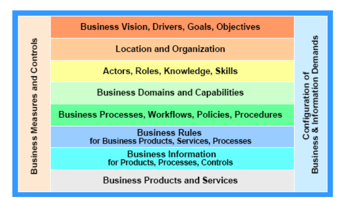
Figure 2. ESARC - Business & Information Reference Architecture.

With specifications from Architecture Governance we define our main Architecture Management procedures for service-oriented enterprise software architectures: service strategy and life cycle management of software and system architecture artifact's state, service security, service testing and monitoring, service contracts, registries, service reuse, service ownership, definition, and versioning.