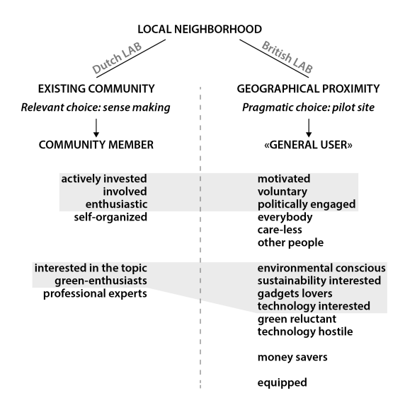
Figure 2. Participants' profiles on basis of interviewees' selection process