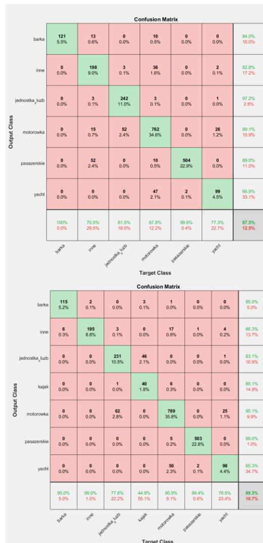
Figure 2. Exemplary confusion matrices for different number of classes in pre-trained GoogleNet solution [4]

SHREC classification service can execute both classification algorithms at once. It also displays the last classified ship. Classification module is especially needed when identification is not possible due to unreadable vessel inscriptions.