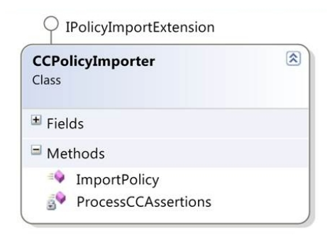
Figure 3. Class diagram for accessing WS-Policy descriptions.

In order to process code contracts policies, the policy-Importers element refers to the class CCPolicyImporter of Figure 3.