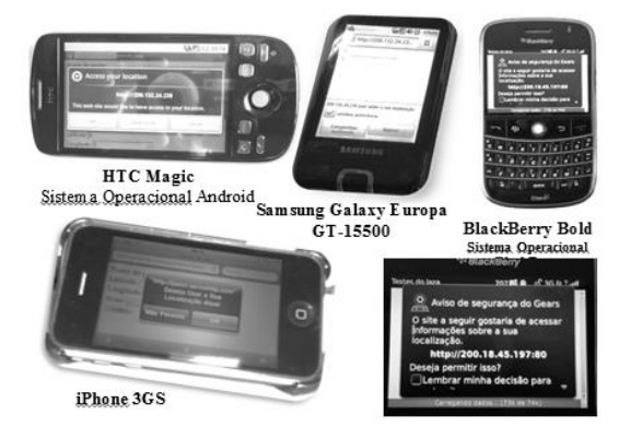
Figure 3. Solicitation of permission to access the device localization.

The initial tests focused on the consolidation of the mechanism for obtaining the location of the technician via the mobile device. Figure 3 shows capture screens in this initial test phase.