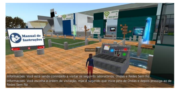
Figure 1 - Waves and Wireless Networks Laboratories entrance.

Two virtual laboratories were used: Waves and Wireless Networks, which are introduced on [22]. According to the authors, in these virtual labs students from Secondary or Technical education have the opportunity to visualize the practical side of some abstract concepts that are part of their daily life. Figure 1 shows a screenshot of the environment entrance. It can be seen that an instruction manual and a control panel were placed at the beginning of the path, to give the user introductory information about the experiment, for example, on how to move around, use the didactic materials and what is expected in this visitation.