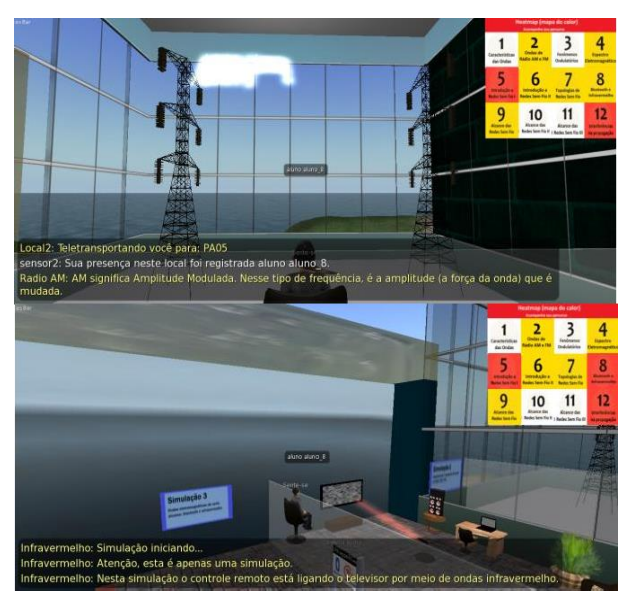
Figure 2 – Heat map HUD under different scenarios.

Figure 2 shows the heat map following the user avatar at different scenarios of the VW. It can be seen, for example, that this user has visited Location 5 very often (red), but Location 3 lacks visiting, as it is still white (top screen). It also shows in the bottom screen that Location 8 is now red, as the user is currently at this location again and probably has spent more 2 minutes observing a simulation (from yellow -2 minutes; to red -4 minutes).