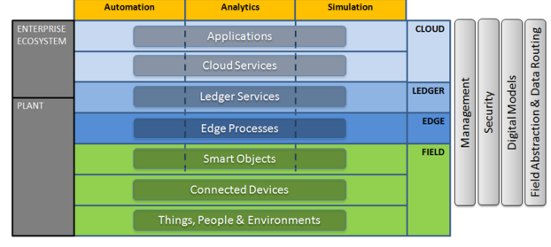
Figure 1. Overview of the FAR-EDGE RA

The FAR-EDGE RA is the conceptual framework that drives the design and the implementation of the project's automation platform based on edge computing and DLT technologies. As an RA, its first goal is communication, i.e. providing a terse representation of concepts, roles, structure and behaviour of the system under analysis for the sake of dissemination and ecosystem-building. Its second goal concerns reuse: exploiting best practices and lessons learned in similar contexts by the global community of system architects.