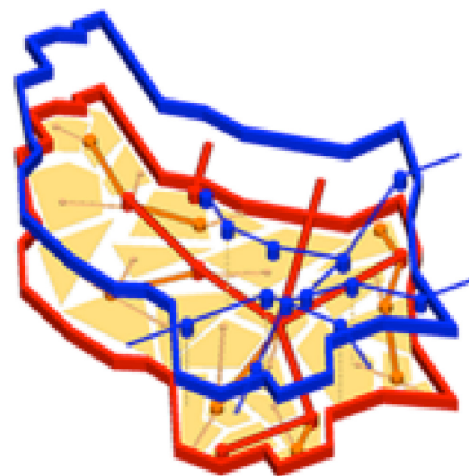
Blue: Highways with interchanges Red: Power supply network with transformers Orange: Power distribution areas

Finally, the use of a multi-touch table in disaster management is explored in [11]; this is just one aspect of the remit of Visual PCI.