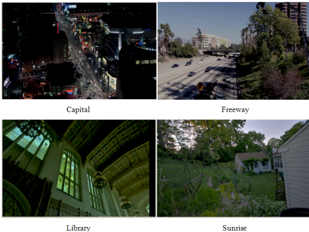
Figure 1. Snap shot of the test sequences.

Conventionally, video compression techniques have considered only 8 bits-per-pixel (bpp) input videos, yet HDR videos require 10-14 bpp. The current design of HEVC provides the necessary capabilities to handle LDR videos of up to 14 bpp without clipping the bit depth during the encoding process. This allows us to encode HDR content using HEVC. However, the compression performance might not be optimal, since HEVC is optimized to compress video content with the statistical distributions of LDR video but not HDR video.