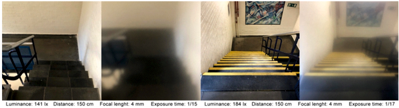
Figure 2. Staircase case study. From left: steps with no edging strip, without glasses (a) steps with no edging strip, with simulation glasses (b), steps with yellow edging strips, without glasses (c), steps with yellow edging strip, with simulation glasses (d).

Firstly, considering stair nosing, it is known by building standards, such as the BS 8300:2018 [37], that the nosing of stairs should be clearly visible from distance. Standards also provide recommendations for operating a visual contrast between the leading part of the tread and its remainder as a supporting feature for visually impaired people [9]. The stairs without edging strips are shown in Figure 2(a), and with simulated impairment (wearing and taking a picture with 4 pairs of glasses) in Figure 2(b). The stairs that did have edging strips are shown in Figure 2(c), and with simulated impairment (wearing and taking a picture with 4 pairs of glasses) in Figure 2(d).