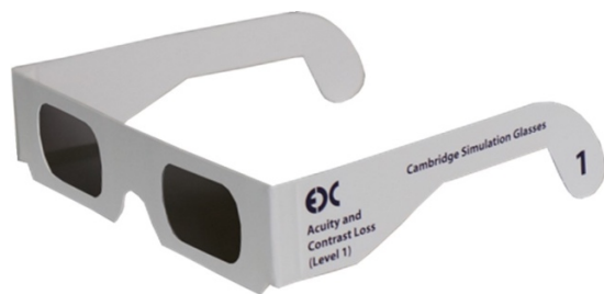
Figure 1. One pair of the Cambridge simulation glasses.